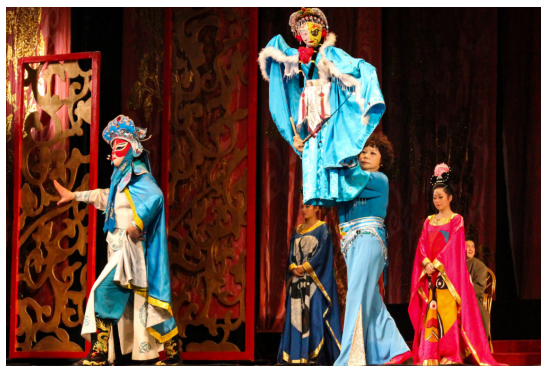
Face Changing Show

Dinner will be served at a local restaurant (not at the show's stage), overnight Chengdu.