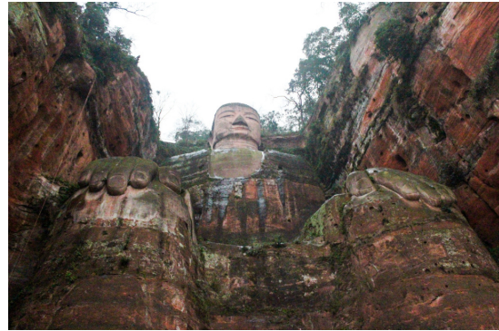
Leshan Giant Buddha

Visit the Leshan Giant Buddha (approx. 02hrs drive) an amazing 71 meter tall stone statue built in the 8 th – 9 th century depicting Maitreya. Carved out of a cliff face that lies at the confluence of the Minjiang, Dadu and Qingyi Rivers near the city of Leshan. This towering stone sculpture faces Mount Emei. Famous for being the largest stone Buddha in the world, the tallest pre-modern statue in the world and a UNESCO World Heritage Site .